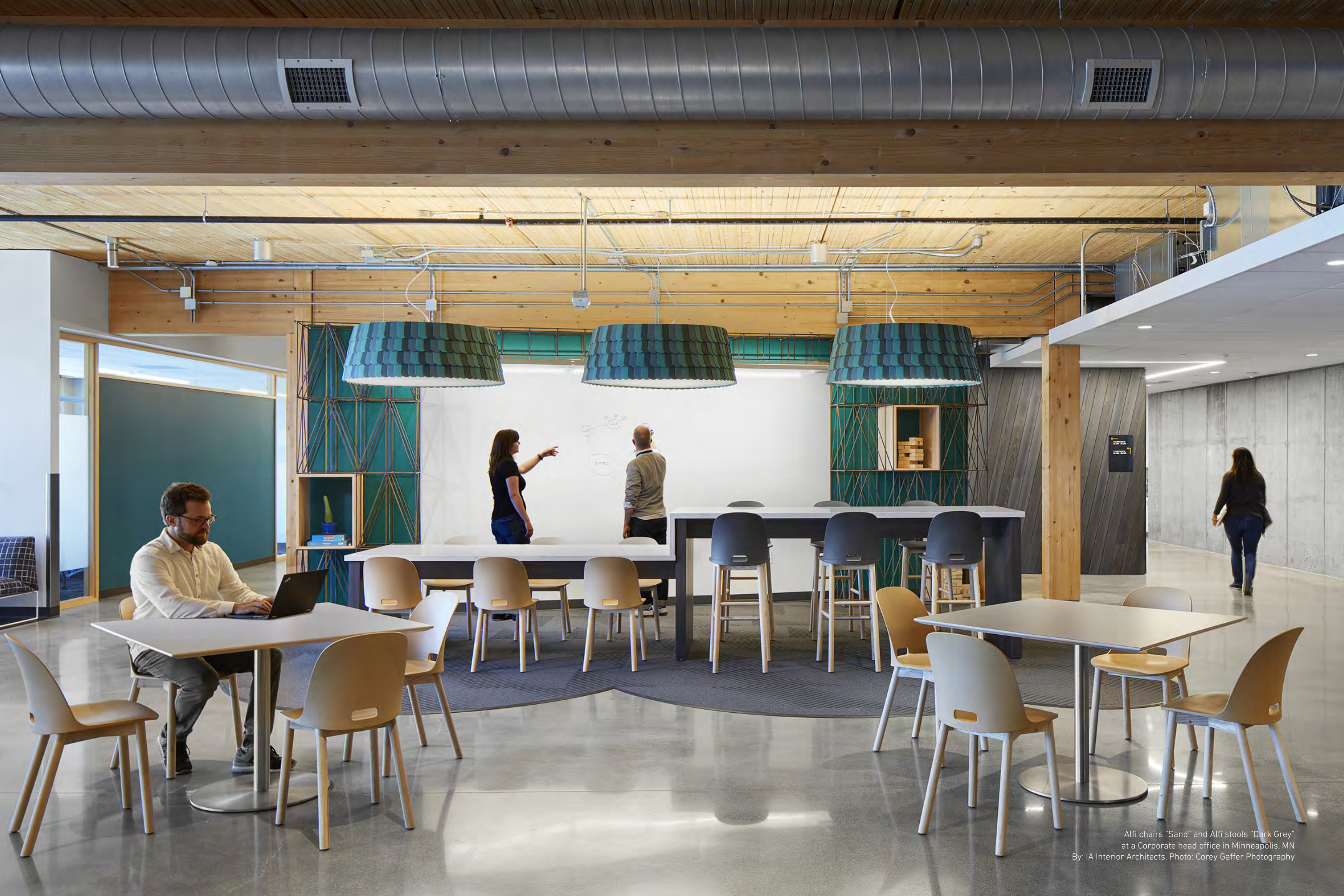
Alfi chairs "Sand" and Alfi stools "Dark Grey" at a Corporate head office in Minneapolis, MN By: IA Interior Architects.