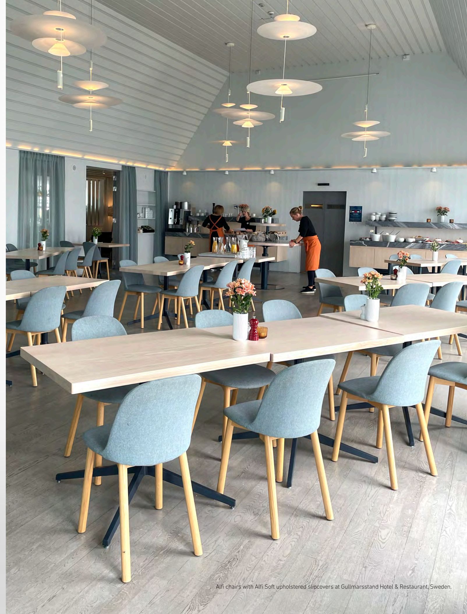
Alfi chairs with Alfi Soft upholstered slipcovers at Gullmarsstrand Hotel & Restaurant, Sweden.