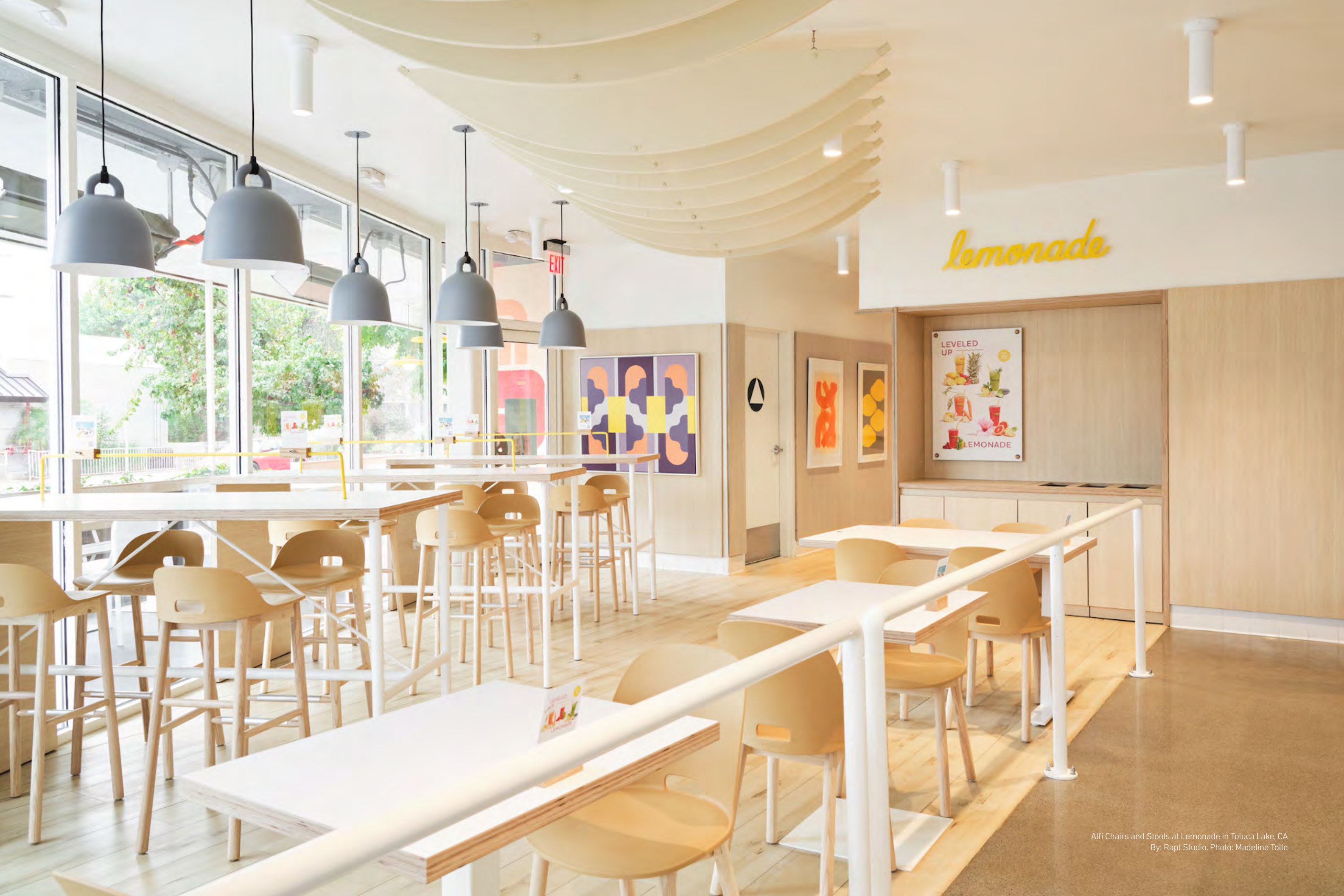
Alfi Chairs and Stools at Lemonade in Toluca Lake, CA By: Rapt Studio.