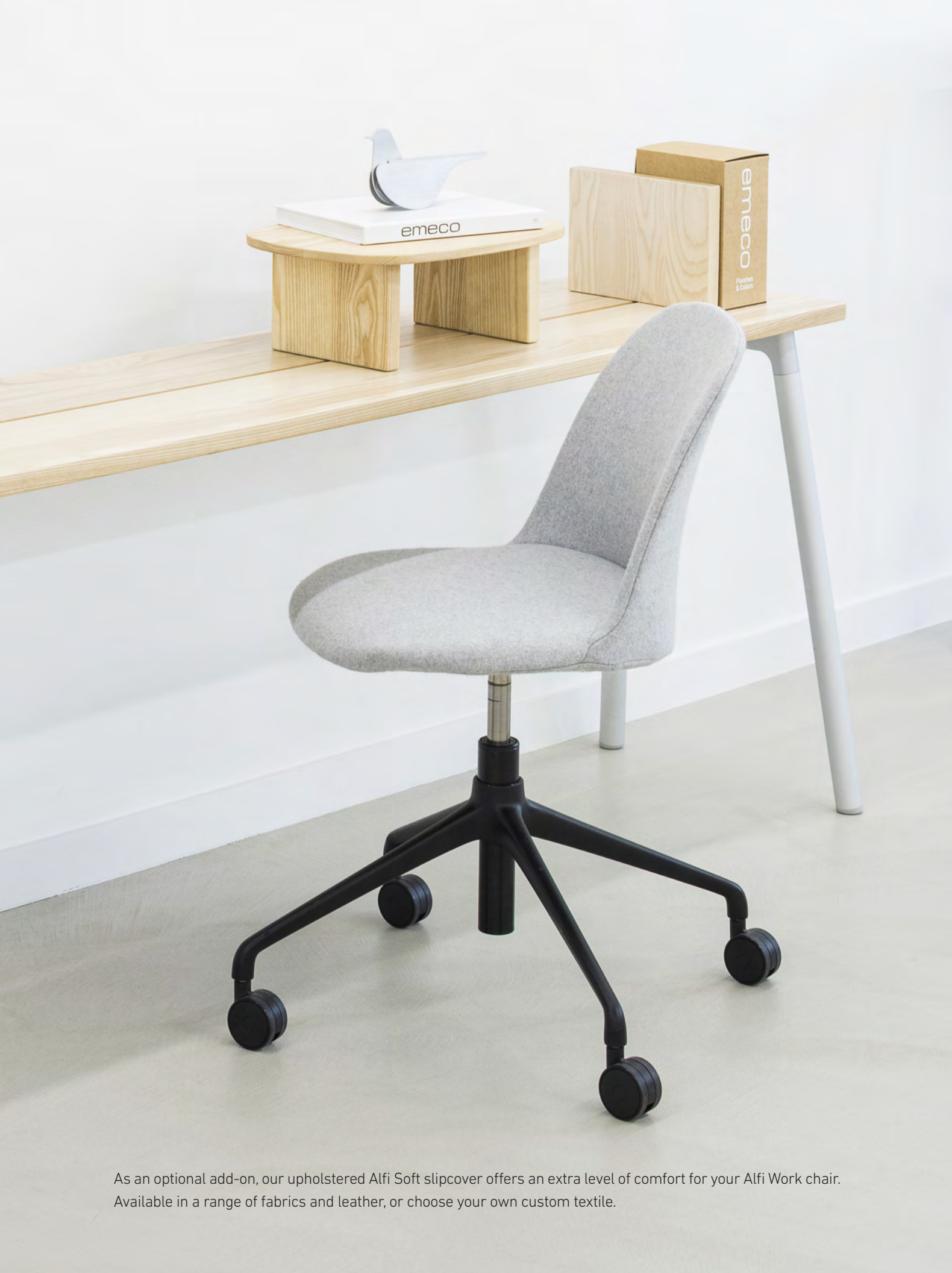
As an optional add-on, our upholstered Alfi Soft slipcover offers an extra level of comfort for your Alfi Work chair. Available in a range of fabrics and leather, or choose your own custom textile.