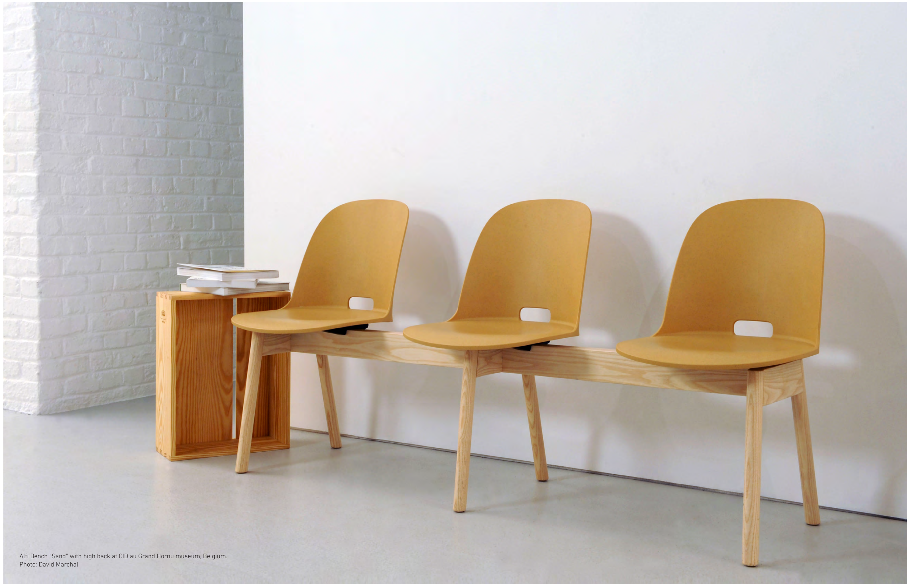
Alfi Bench "Sand" with high back at CID au Grand Hornu museum, Belgium.