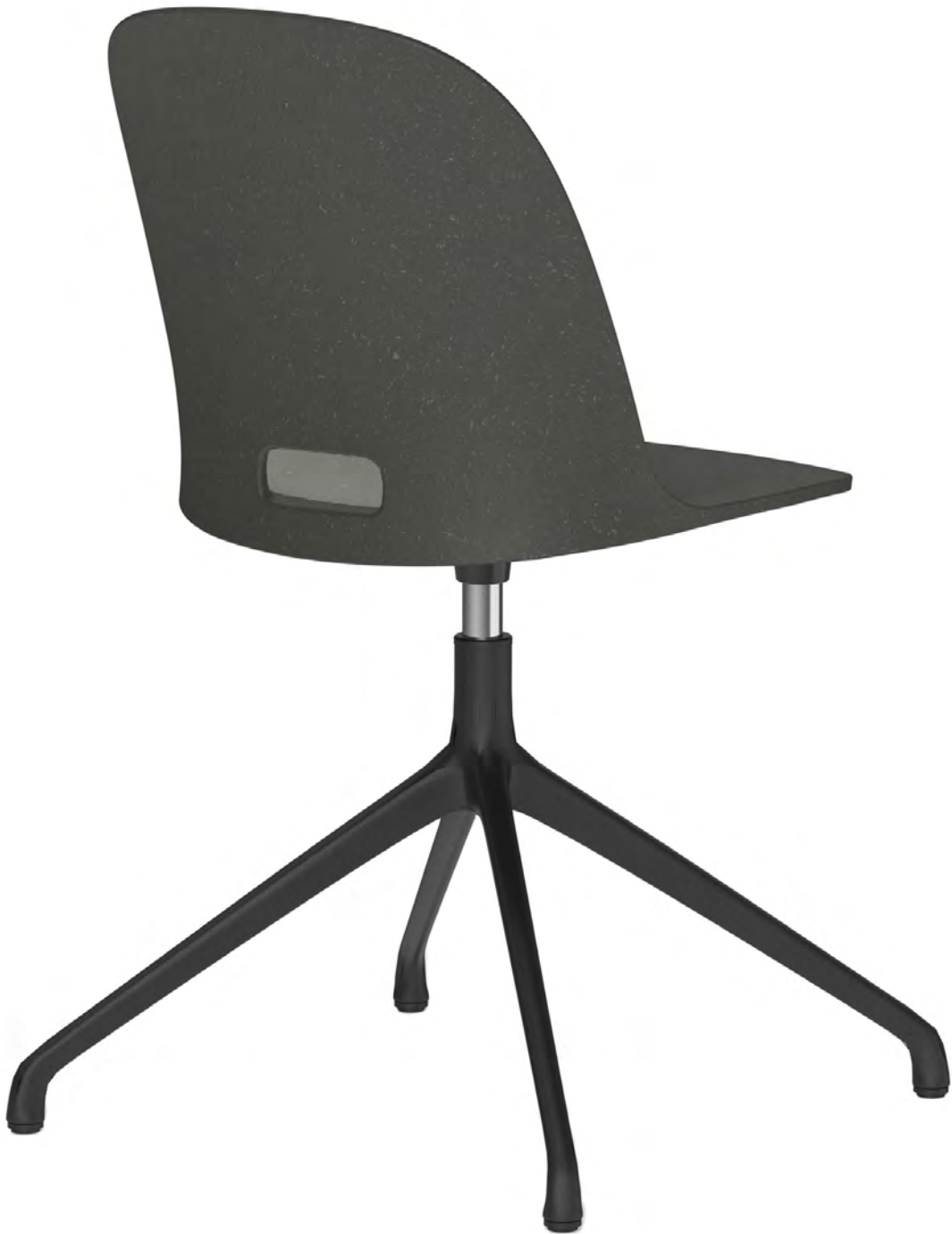
Alfi Work with glides comes with plastic glides for all-around use or felt glides for hard floors. The swivel base with glides has a fixed seat height.